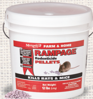
22112 - 12lb. Pail Loose Pellets Active: Bromethalin (acute)