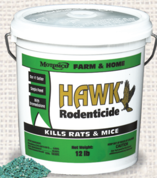
31155 - 12lb. Pail Loose Pellets Active: Bromadiolone (anticoagulant)