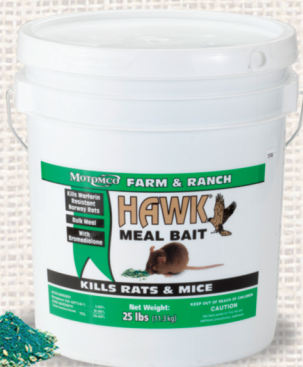
31125 - 25lb. Pail & 31111 - 50lb. Pail Active: Bromadiolone (anticoagulant)