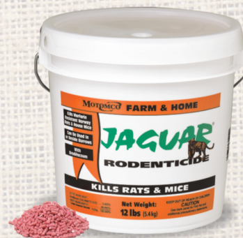
31402 - 12lb. Pail Loose Pellets Active: Brodifacoum (anticoagulant)

For more information on burrow baiting, clean out, or any of Motomco's products, contact your local Motomco Territory Manager or visit www.motomco.com