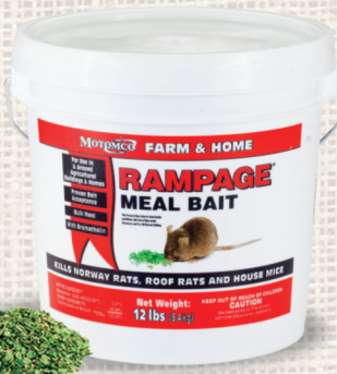
22925 - 12lb. Pail Active: Bromethalin (acute)