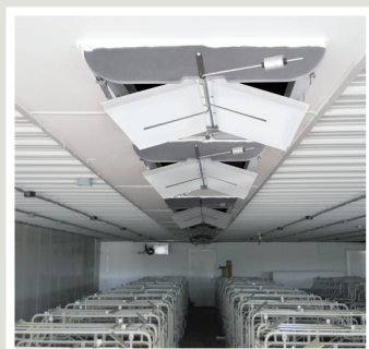
JD2600 Gravity Air Inlets installed in Hog Barn