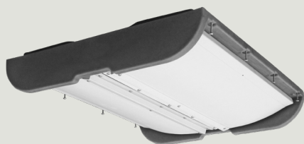
JD2900 Inlet in Closed Position