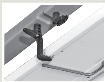
Two-Stage Shut-off to protect from wind pressure