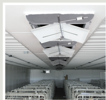
JD2900 Gravity Air Inlets installed in Hog Barn