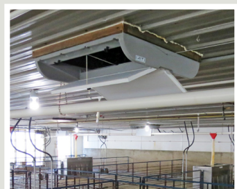
JD2900 Actuated Inlet can also be single pulled