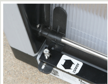
Adjustable counterweight bar