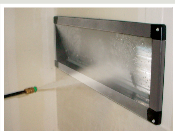
Easy to power wash clean